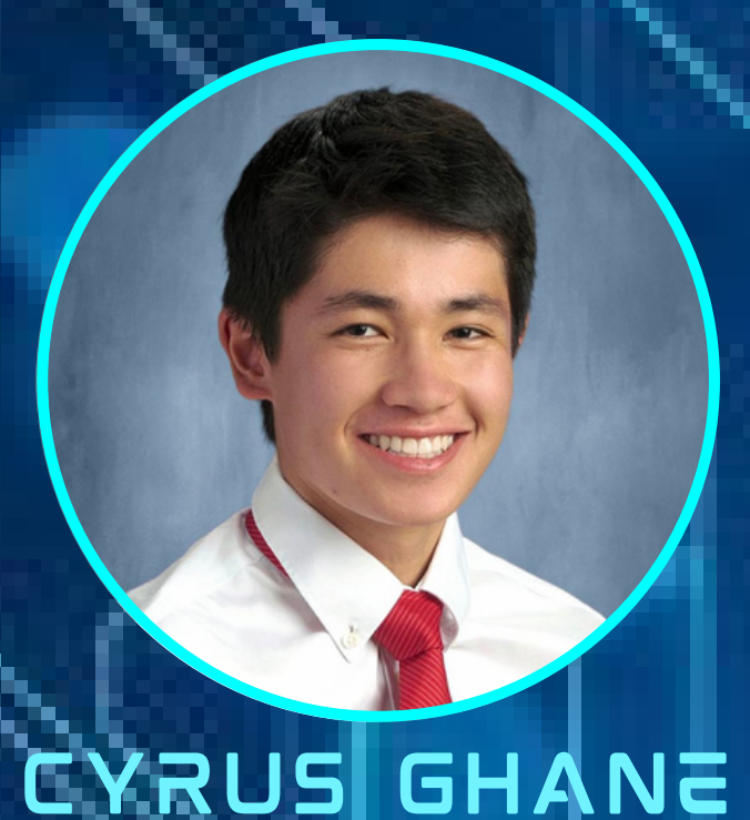
USAPhO Honorable Mention

ELECTROMAGNETISM FOR AP PHYSICS 2 AND AP PHYSICS C